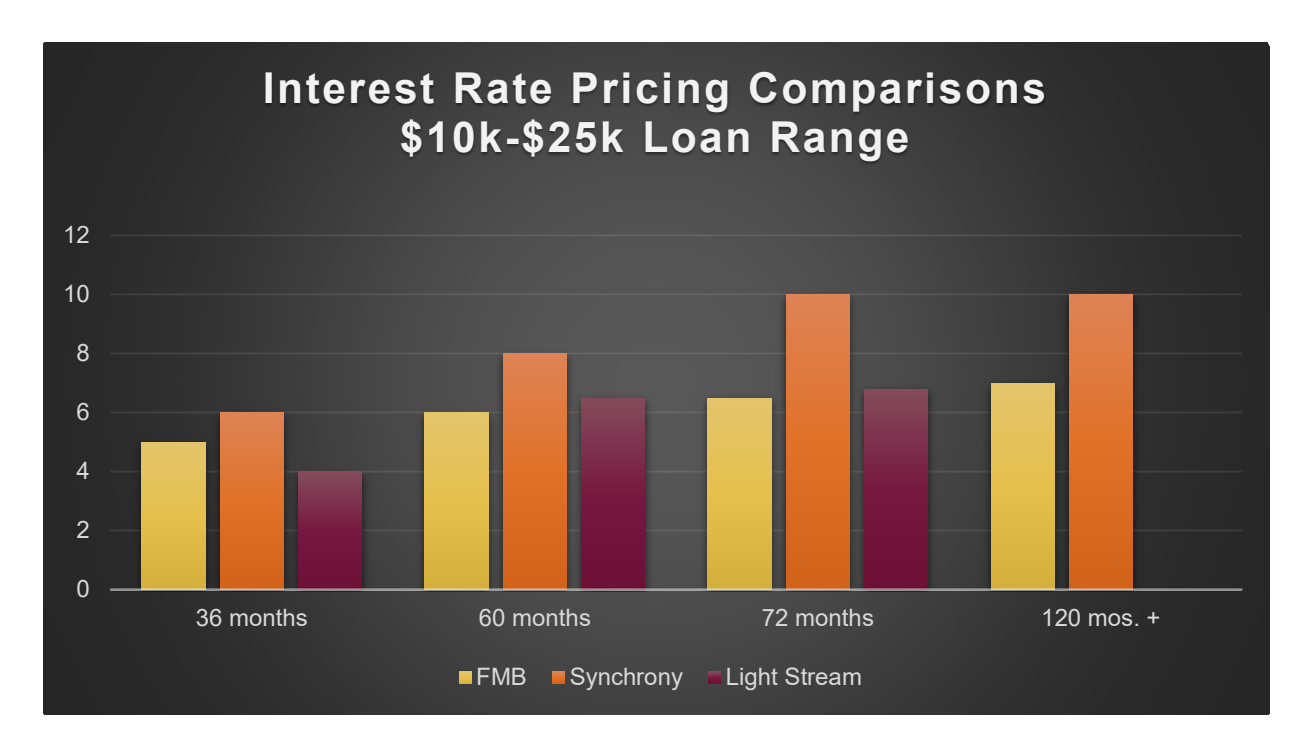
*Note-Light Stream does not provide 120-month financing for the subject loan range

Although, Light Stream does permit larger unsecured transactions than the proposed FMB unsecured home improvement plan, it's clear that the FMB residential energy loan promotion has its benefits when compared to the $10,000-$25,000 categories 61-120 months.