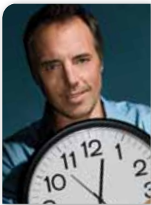
> Dan Buettner Bestselling Author and World-Renowned National Geographic Explorer