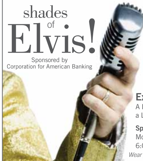
Exhibit Hall Party A Little Less Conversation, a Little More Action

Sponsored by Corporation for American Banking