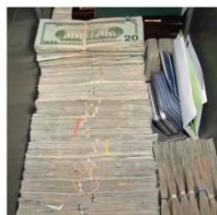
U.S. currency discovered in safe deposit box and seized by ICE.

A joint investigation by U.S. Immigration and Customs Enforcement (ICE) and the Drug Enforcement Administration (DEA) into drug trafficking at the Southwest border revealed a multi-million dollar money laundering organization, utilizing multiple companies, and numerous bank accounts, to launder narcotic proceeds. This case study demonstrates methodologies used for laundering criminal proceeds.