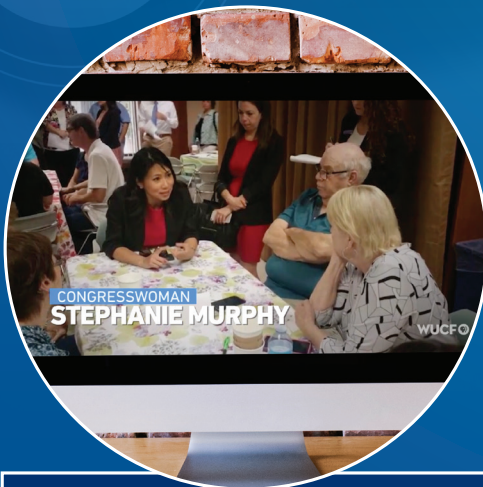
Rep. Stephanie Murphy (FL-7)