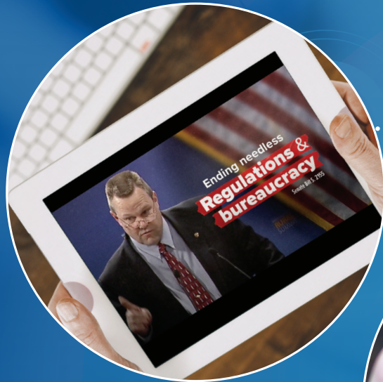
Sen. Jon Tester (MT)

ABA's Voter Education program continues to impact the national dialogue by supporting the efforts of pro-growth leaders who are focused on keeping America's economy strong.