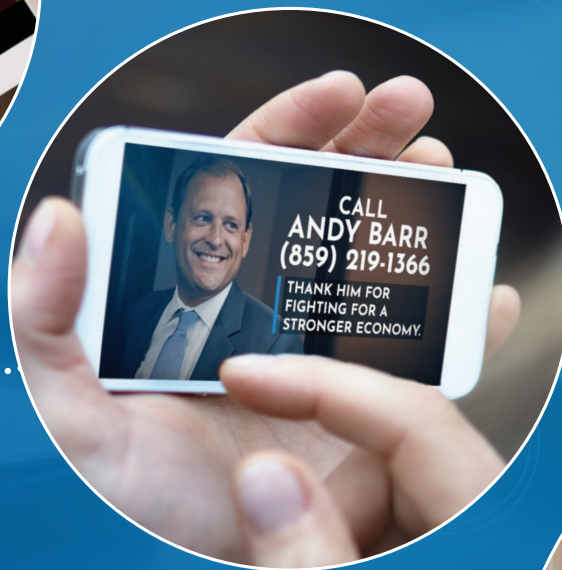
Rep. Andy Barr (KY-06)