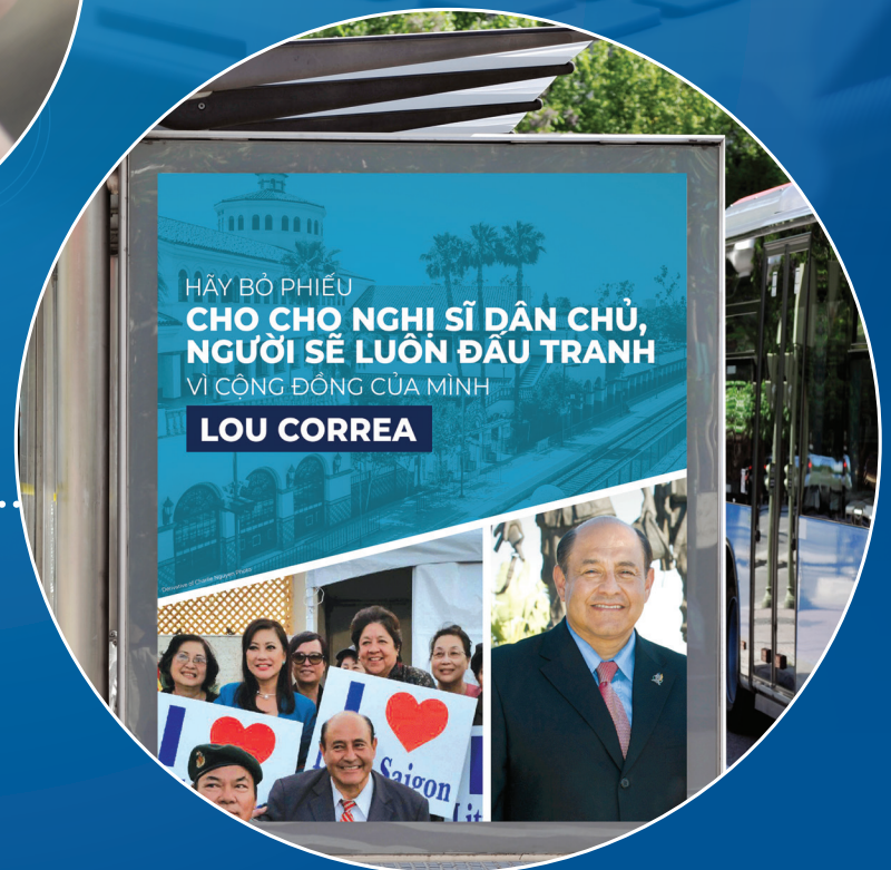
Rep. Lou Correa (CA-46)